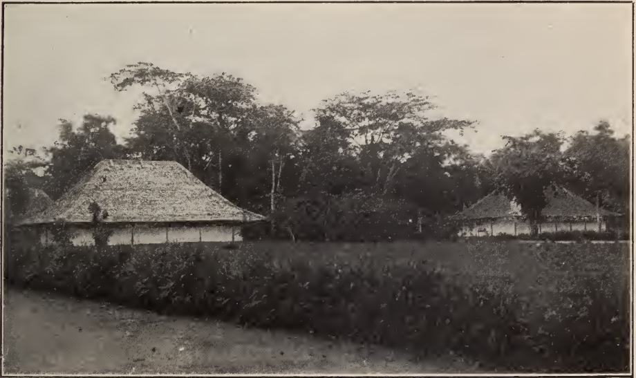
THE SCHOOLHOUSES, KONGO BALOLO MISSION, BONGANDANGA, AFRICA

we kill them, will not God do something terrible to us?"